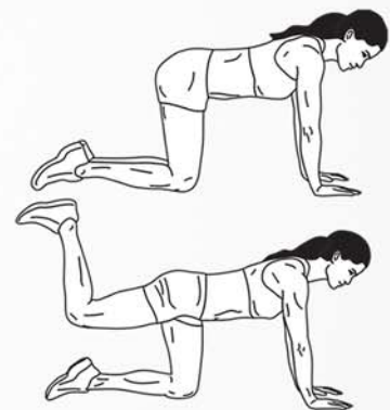
20 donkey kicks