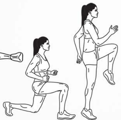
20 lunge step-ups