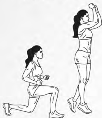
6 jumping lunges

LEVEL I 3 sets LEVEL II 5 sets LEVEL III 7 sets REST up to 2 minutes