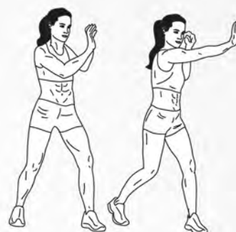
20 palm strikes