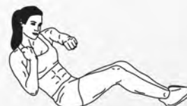
20 sitting punches