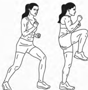
10 knee strikes