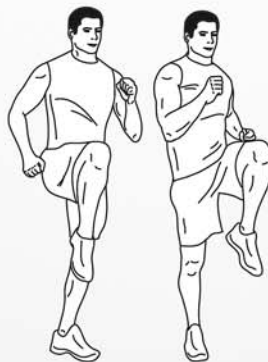
20sec high knees