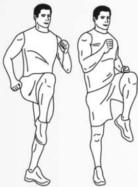
20sec high knees

Level I 3 sets Level II 5 sets Level III 7 sets | 2 minutes rest