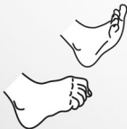
4. clench / unclench