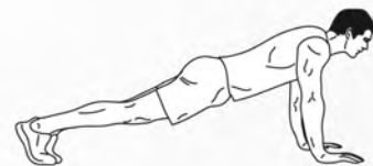
10-count plank hold