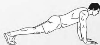
10-count plank hold