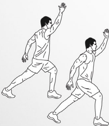
20 split jacks