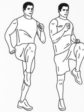
20 high knees