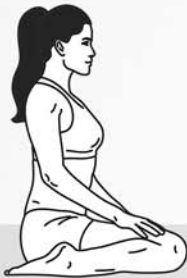
20sec hero pose