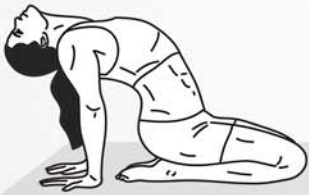
20sec camel pose