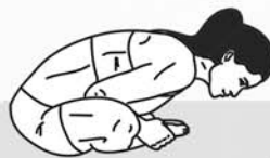
20sec butterfly fold